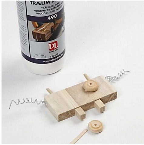
7. Glue on the other parts.