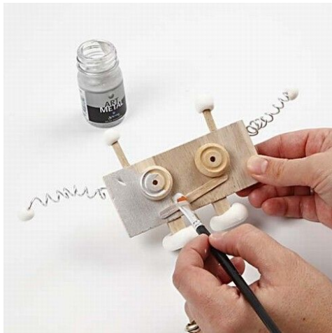
9. Paint the robot with Art Metal silver paint.