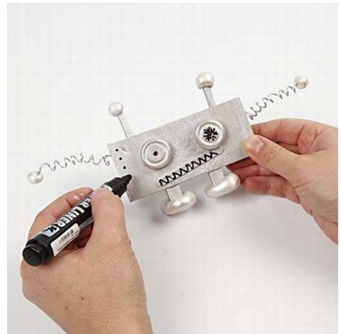
10. Decorate the robot with a black power liner permanent marker.