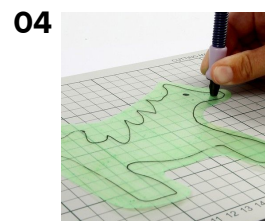
04 Make two holes in the design.