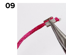
09 Cut a piece of satin cord for the necklace and attach fold-over cord ends onto each end of the satin cord.