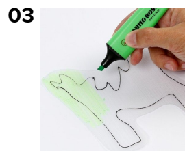
03 Colour in the design with a Stabilo neon marker.