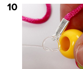
10 Tie the end of the elastic beading cord onto the loops of the fold-over cord ends.