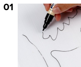
01 Draw a design on a shrink plastic sheet.

Krympeplast er farget med neon Markere, krympt i ovn og satt på et halskjede av plastperler og satengsnor.