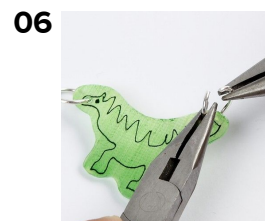
06 Attach a round jump ring in each hole.