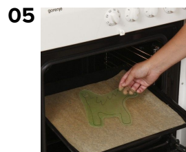
05 Put it in the oven at 160°C until the design shrinks – curls up and then flattens again.