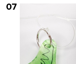
07 Tie a piece of elastic beading cord in each round jump ring.