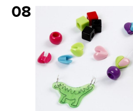
08 Thread heart plastic beads onto the elastic beading cord.