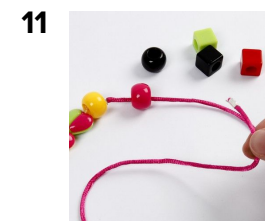
11 Thread a couple of plastic beads onto the cord to hide the joint.